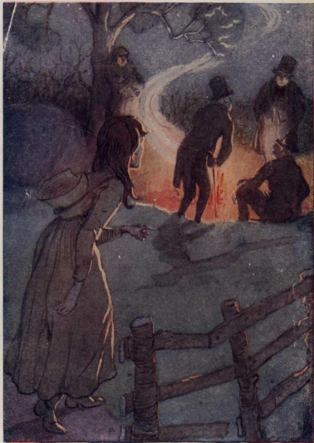
After a few moments she moved nearer to the group (page 108)

After a few moments she moved nearer to the group