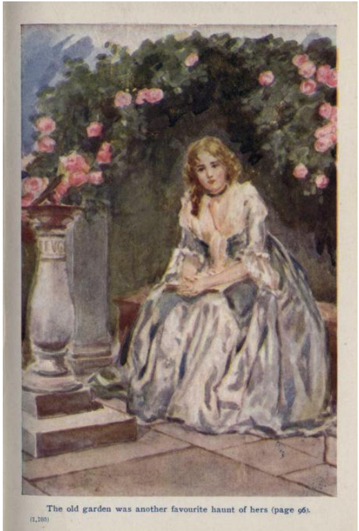
The old garden was another favourite haunt of hers (page 96).

he was proud to find in his daughter an erudition and talent very rare amongst women in those days.