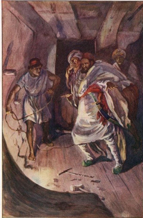
THE SUBAHDAR FALLS INTO THE TRAP.