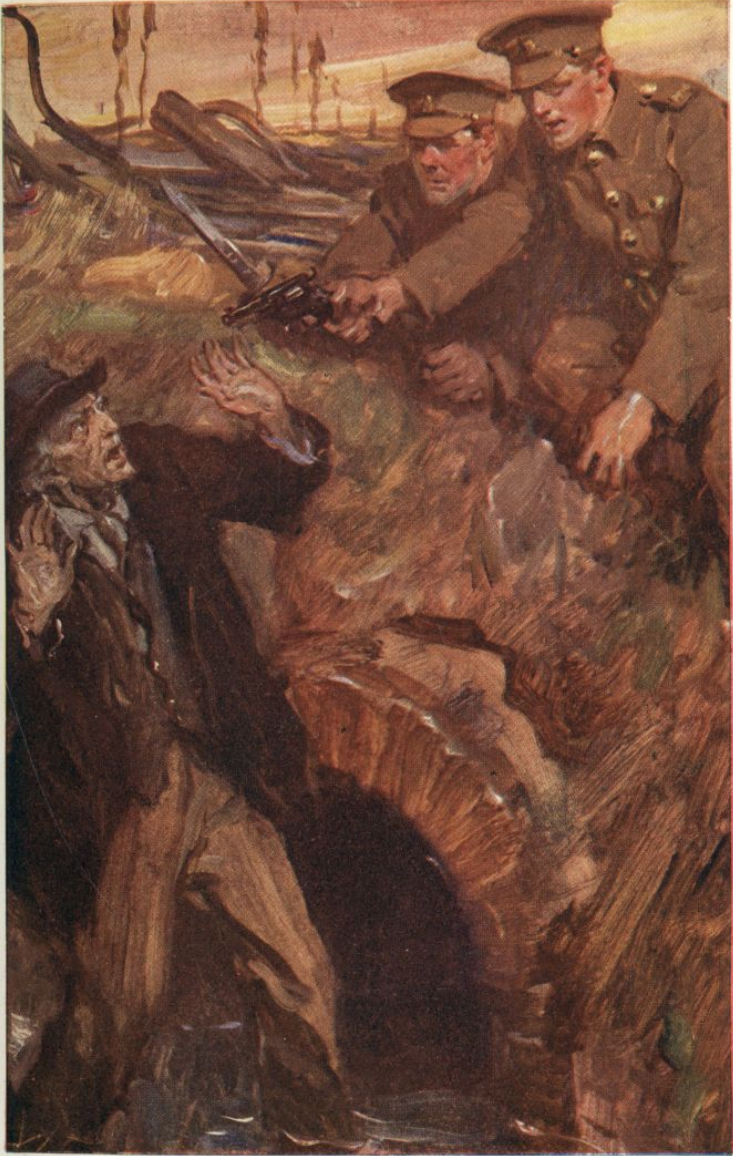
"HANDS UP! "