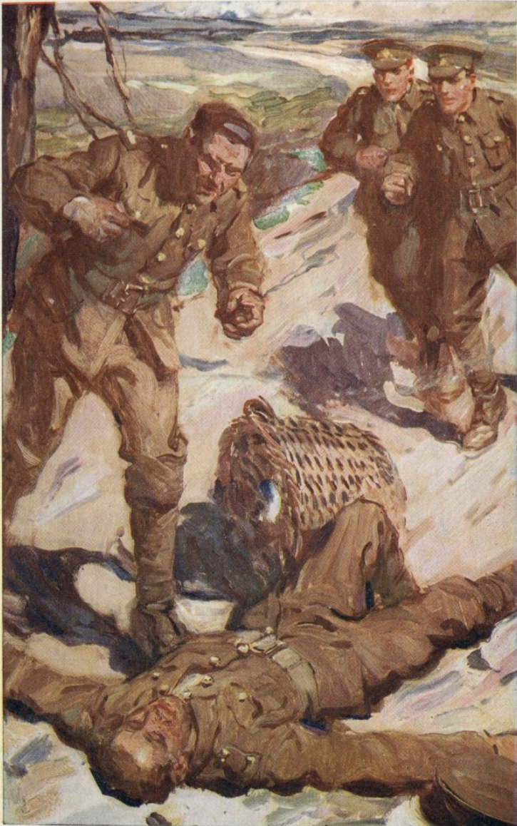
A FOUL BLOW