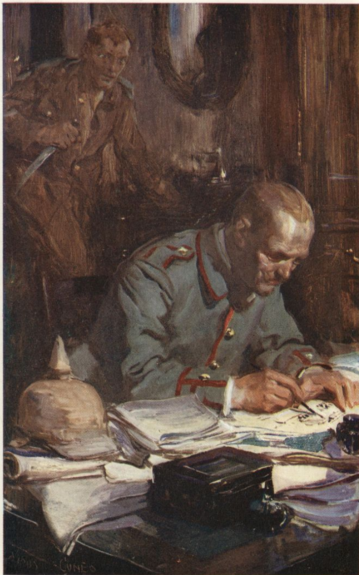
THE INTRUDER IN KHAKI