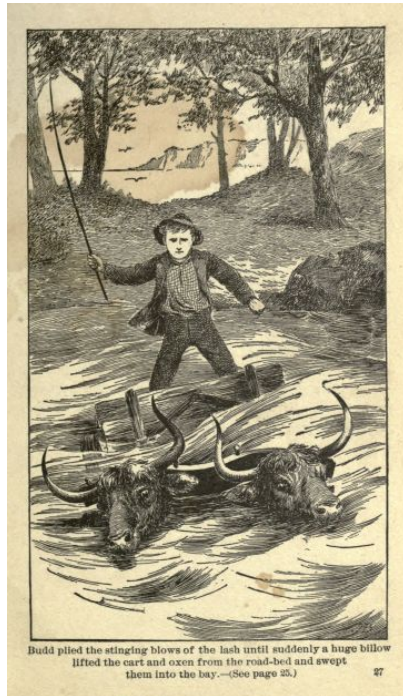
Budd plied the stinging blows of the lash until suddenly a huge billow lifted the cart and oxen from the road-bed and swept them into the bay.

the waves dashed over their backs and rushed into the cart, wetting Budd to the knees. Then there came suddenly a huge billow, rolling outward, that lifted the cart and oxen from the road-bed and swept them out into the bay.