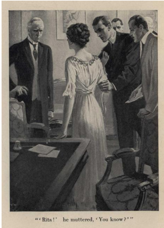
“‘Rita!’ he muttered, ‘You know?’”