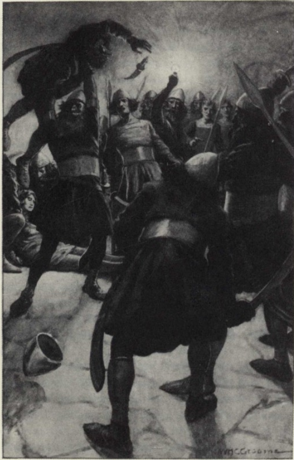
The assailant was lifted high in the air and flung down with terrible force.