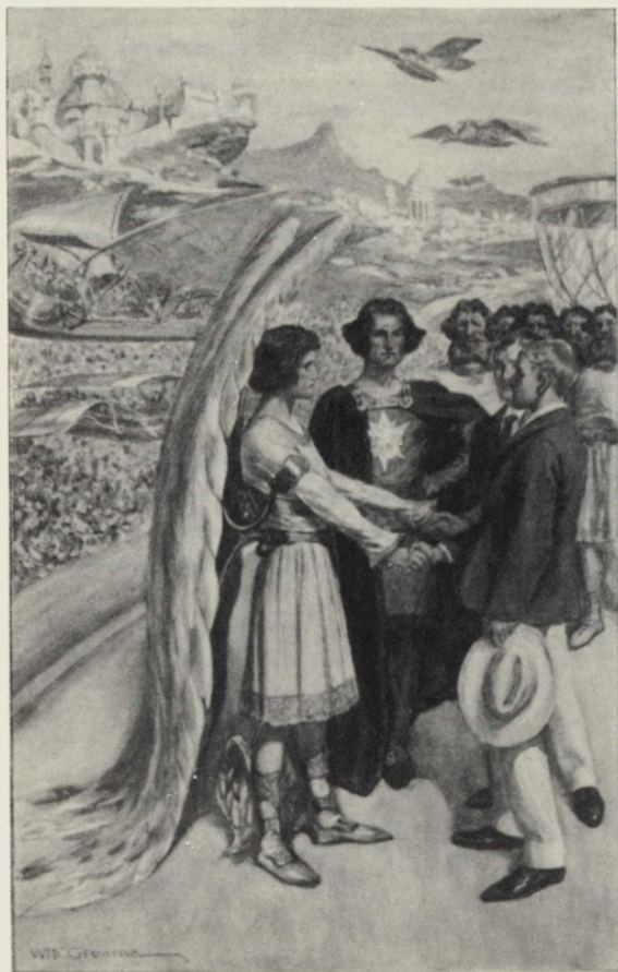
They returned his greeting as heartily as it was given. M.—Front. PAGE 91.

They returned his greeting as heartily as it was given.—Front. PAGE 91.