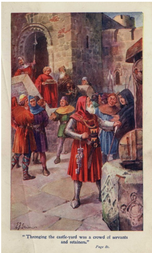
“Thronging the castle-yard was a crowd of servants and retainers.”