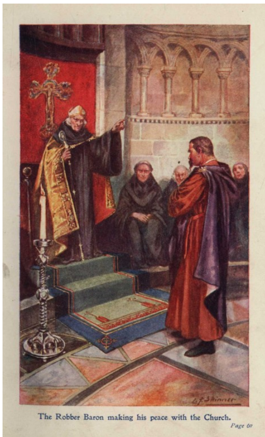
The Robber Baron making his peace with the Church.

suitable homily, adorned with texts and quotations, on the special subject of the readiness of the Church to receive sinners back to her arms. It concluded with a broad hint that the abbey should be compensated for the harm done to her; but it was a guarded discourse, for the abbot could not tell how the dreaded tyrant might receive his suggestion.