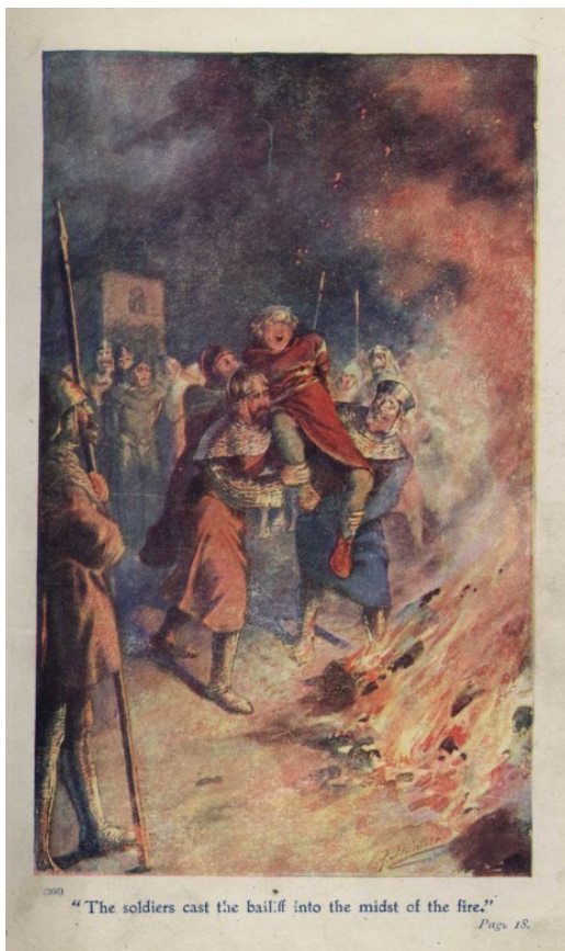
"The soldiers cast the bailiff into the midst of the fire."