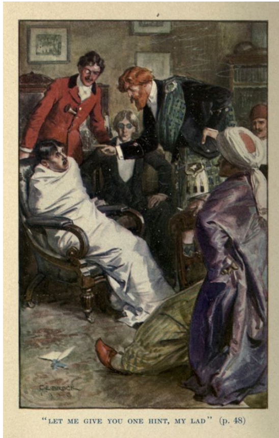
"LET ME GIVE YOU ONE HINT, MY LAD" (p. 48)